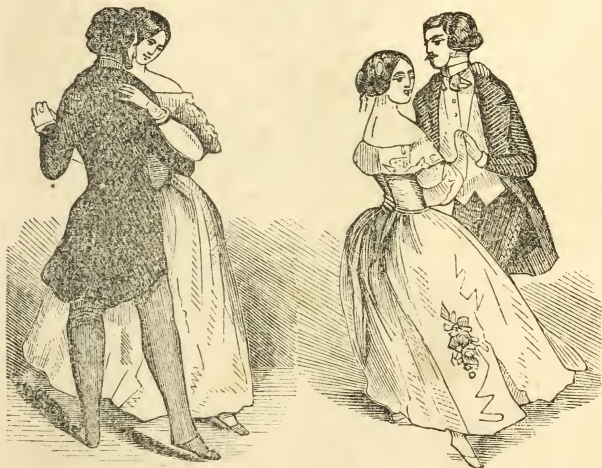
WALTZ OF THREE STEPS.

She should let herself be guided entirely by the gentleman, who alone imparts to her the direction of the dance, conducts her to this or that part of the ball-room, and decides the repose and the re-commencement of the dance.